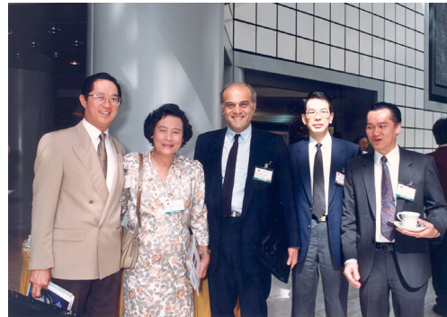
1) Professor Magdi Yacoub from the UK to Singapore, 1990.

Visitors from Overseas Inspirational to the AFC: