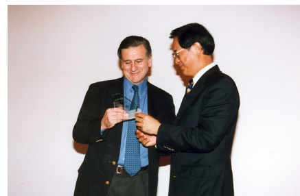
3) Professor Valentino Fuster, representing ACC (USA) and ESC, to Singapore, 2008.