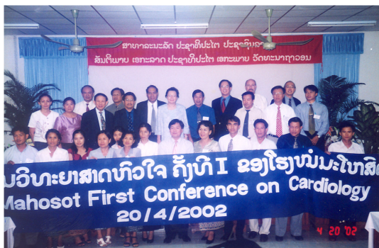
30) First Laos Cardiology Conference, organized jointly with AFC 2002.