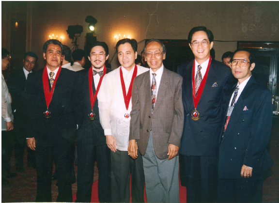
THE 12th ASEAN CONGRESS OF CARDIOLOGY Theme: ASEAN Cardiology in the Heart of the Next Millennium December 6-10, 1998 Edsa Shangri-la Hotel Manila, Philippines