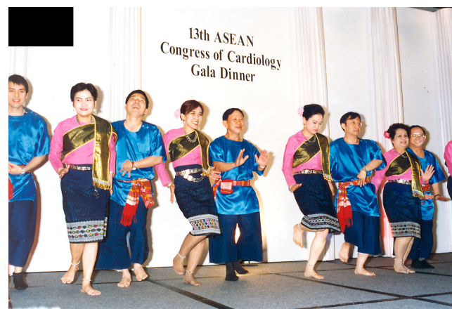
8) Gala Night performance from Thailand, 2002.