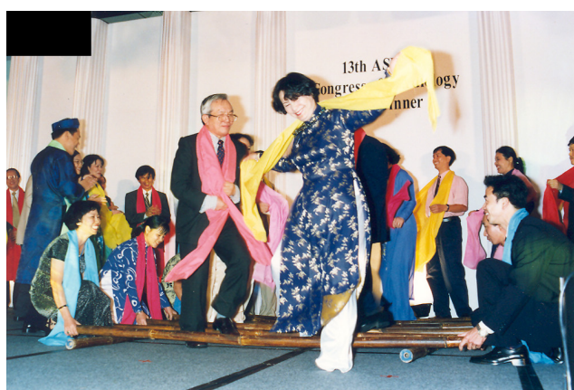
11) Gala Night performance from Vietnam, 2002.