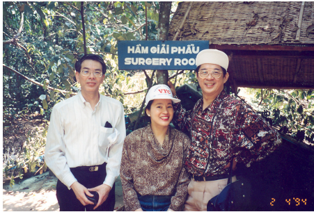
28) Visit to Gucci Tunnels.