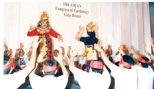
7) Gala Night performance from Indonesia, 2002.