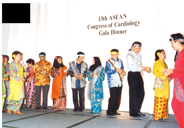
10) Gala Night performance from Malaysia, 2002.