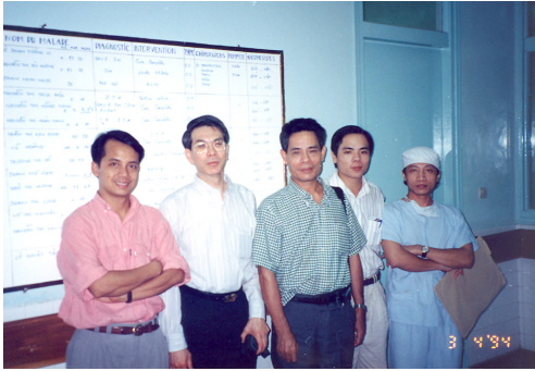
27) Visit to Ho Chi Minh City, Alain Carpentier Hospital: Joseph Sheares.