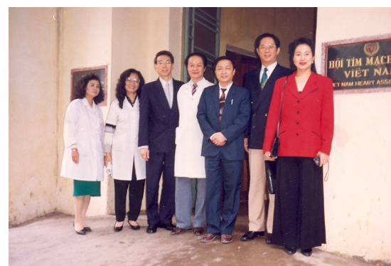
26) Visit to Vietnam, 1994.