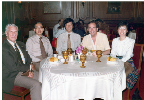
2) Professor Christiaan Barnard from South Africa to Singapore, 1982.