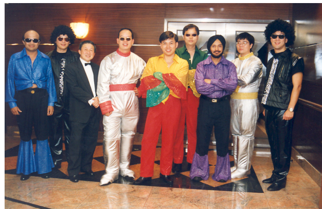
12) Gala Night performance from Singapore cardiologists, 2002.